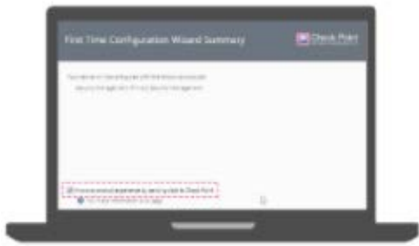
Configure Your Check Point Policy