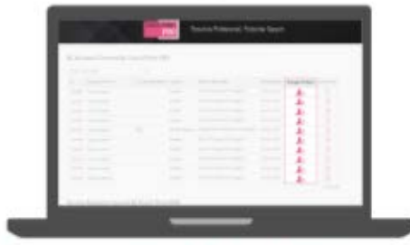
Setup Your Check Point PRO Contacts